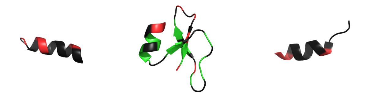
Figure 1 : Structures of various AMPs. From left to right, CM-15 (hybrid, synthetic AMP), Human Beta Defensin-1 (human AMP) and Indolicidin (bovine AMP). The colors represent amino acid residues that are hydrophobic, polar or charged.

crucial role for Antimicrobial peptides (AMPs). AMPs are part of our immune systems – they are present on our skin, in our saliva, tears and in white blood cells. AMPs help us fight infections by directly killing invading bacteria, and by signaling our immune systems to start working! They were first discovered in the 1970s. Scientists have discovered more than 2500 natural AMPs with varying structures, lengths and sequences. Some AMPs are shown in Figure 1. Almost every organism has one of these 'natural' antibiotics.