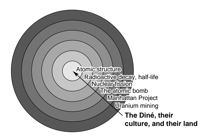
Figure 1. Diagram representing the teaching approach for the course Uranium and American Indians. This course is taught through the context of the Diné, their culture, and their land, to the underlying scientific topics.

Finding suitable teaching materials was the second problem we faced. Funded by two course development grants, we traveled to the Four Corners Area (the border conjunction of the states of Arizona, New Mexico, Colorado, and Utah) to speak with local experts, visit uranium mining and milling