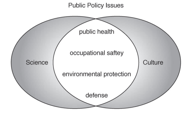
Figure 3. Diagram of the relationship between science and culture intersecting at issues of public policy.

quiry, we constructed a different model, Figure 3. It locates chemistry and culture as the two foci for the course, using the issues of public policy to connect them.