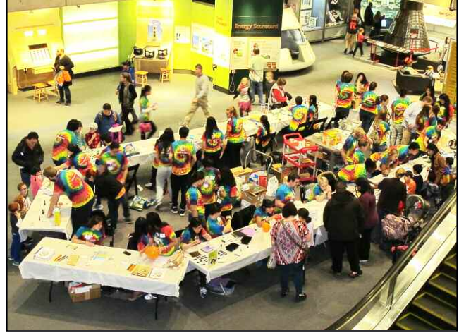
Young chemists enjoying chemistry-related activities at the Boston Museum of Science.